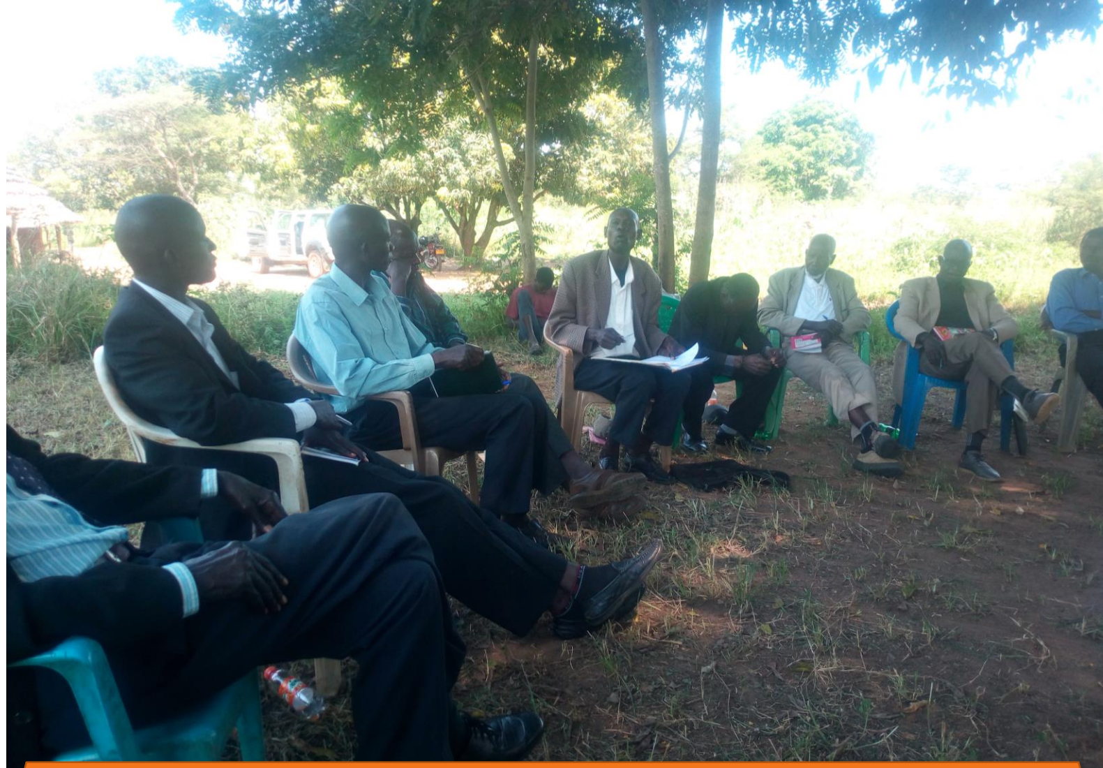
Participants in a local level clan leaders' meeting