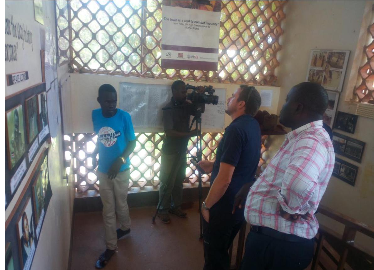
Al Jazeera Team studying the photo wall at the NMPDC